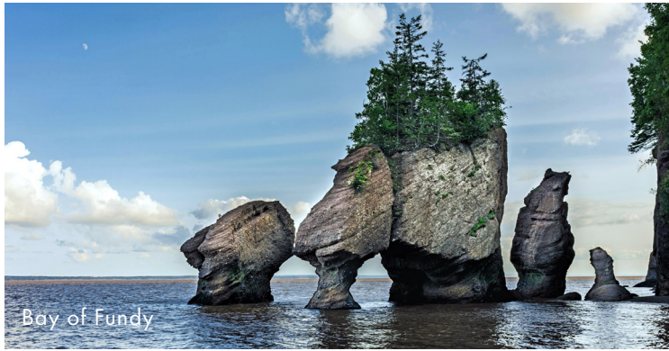
Bay of Fundy