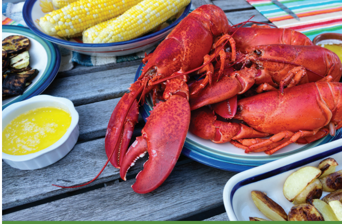
Get ready for a culinary treat on Day 5. We'll be indulging in a classic Maine lobster dinner that promises to delight your taste buds.